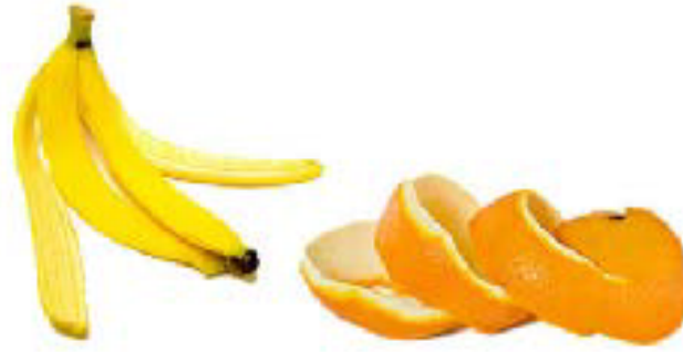
Orange or Banana Peels