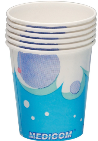
Plastic Coated Paper