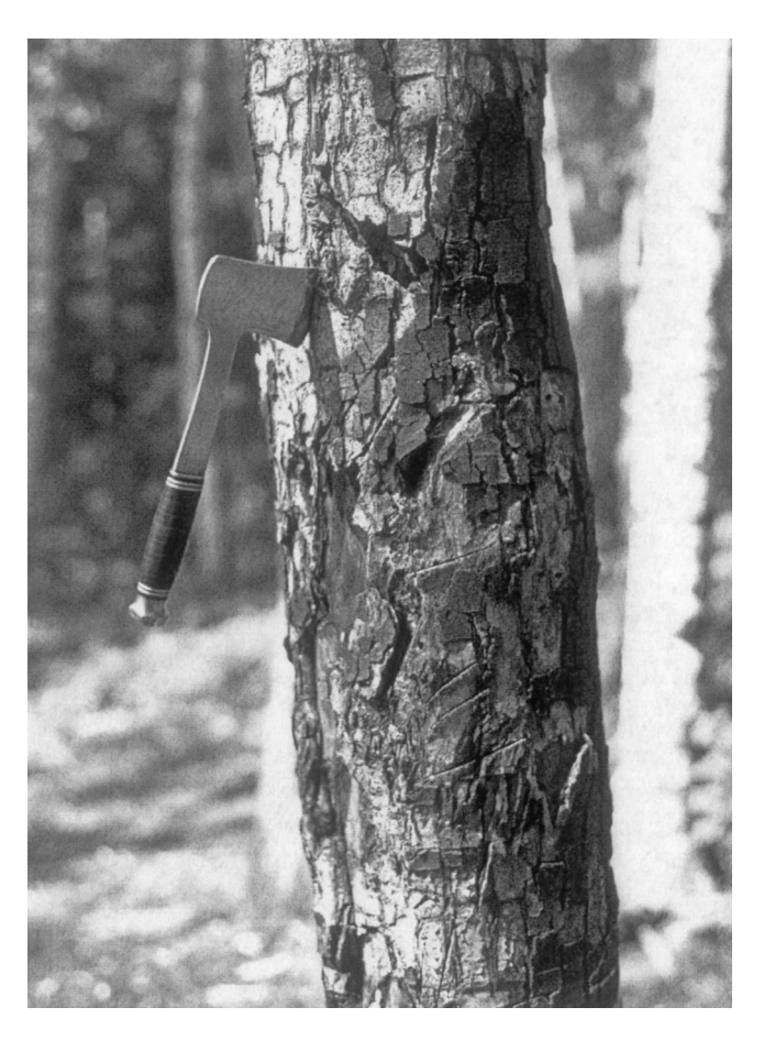
Figure 1. Severe tree damage, such as to this Paper Birch, is aesthetically displeasing to visitors and can kill the tree.

Monitoring studies often use the number of informal trails as an indicator of the extent of adjacent offsite vegetation trampling. Managers consider larger densities of such trails to be closely associated with firewood-gathering activities. McEwen and others (1996) found a total of 167 informal trails associated with campsites, although studies in Great Smoky Mountains and New River Gorge have shown totals of 1087 and 221 informal trails, respectively (Marion and Leung 1997, 1998). Although informal trails associated with campsites may be used for firewood gathering, they are also used to access the site, water, other sites, restroom areas, and scenic features. Therefore, it is